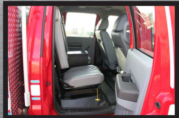
SCBA Seating —Rugged SCBA seating