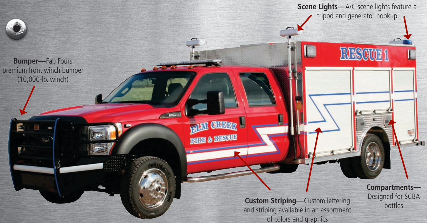
Bumper —Fab Fours premium front winch bumper (10,000-lb. winch)

No fire or rescue team is properly equipped without a custom FYR-TEK rescue unit. Give us your specific needs, and we'll create a solution that works. Take a look at the following custom vehicles, then let's get started on yours.