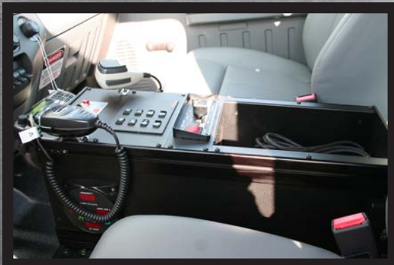
Center Console —Keep information within reach thanks to a strategically designed front or rear console