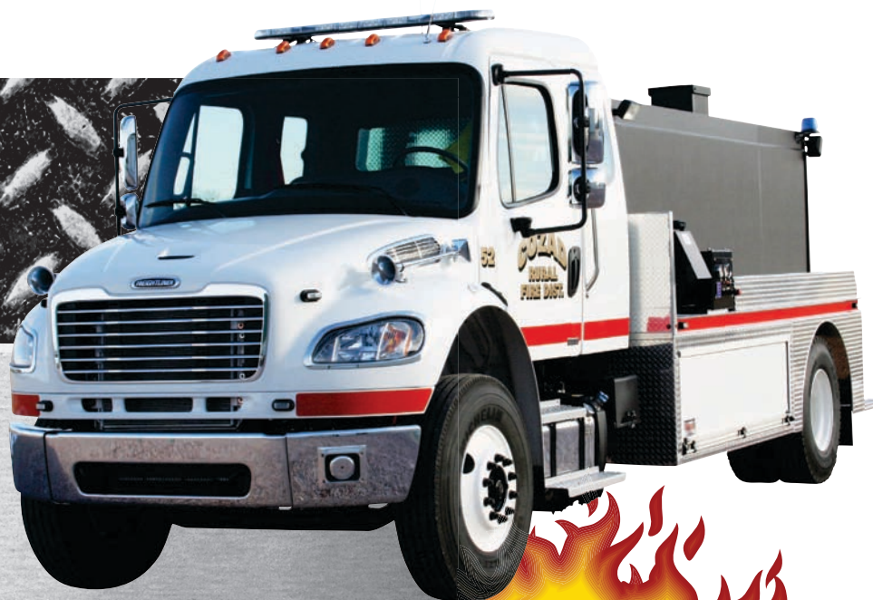
Rack —2,000-gallon portable Fold-A-Tank rack